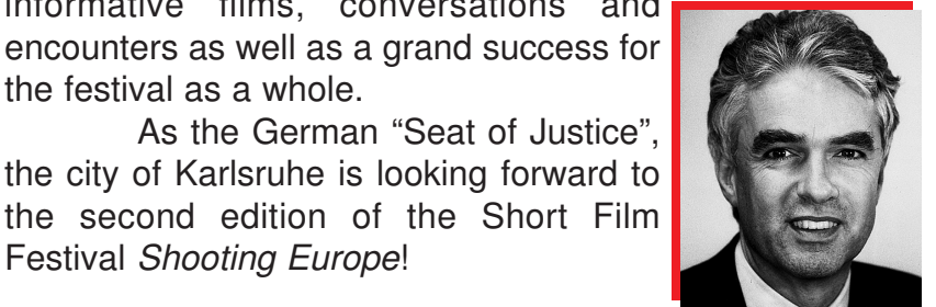
Ullrich Eidenmüller Mayor of the city of Karlsruhe

As the German "Seat of Justice", the city of Karlsruhe is looking forward to the second edition of the Short Film Festival Shooting Europe!